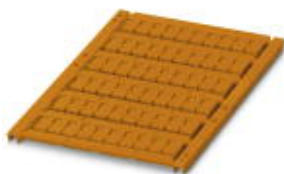
The figure shows the UCT-TM 6 version

UniCard materials for thermal transfer printer, for labeling Weidmüller, Conta Clip, and Klemsan terminal blocks, 60-section, can be labeled with THERMOMARK CARD and BLUEMARK LED, color: orange